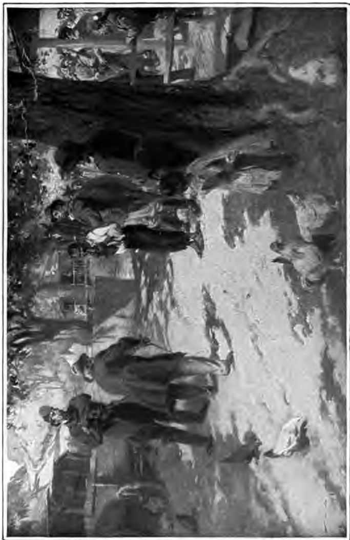
“Speak up, nigger.”